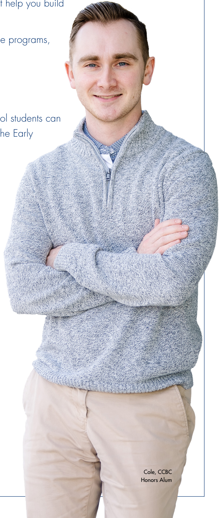
Cole, CCBC Honors Alum

ATTEND CCBC TUITION FREE! ccbcmd.edu/freetuition